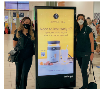
National Outdoor Advertising