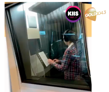
National Radio Campaign