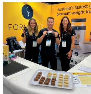
National Conference Circuit