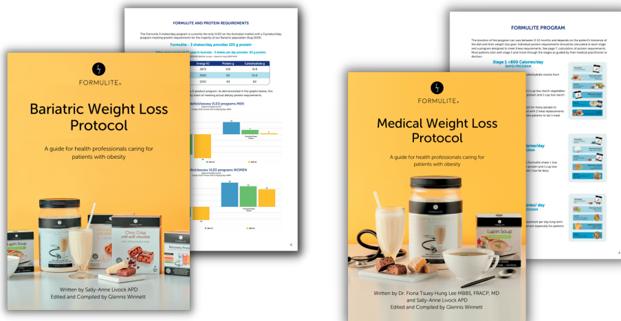
Medical and Bariatric Protocols Training Material