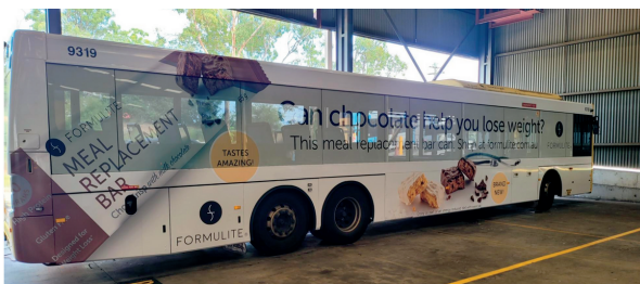
Superbus Installation Sydney Metro